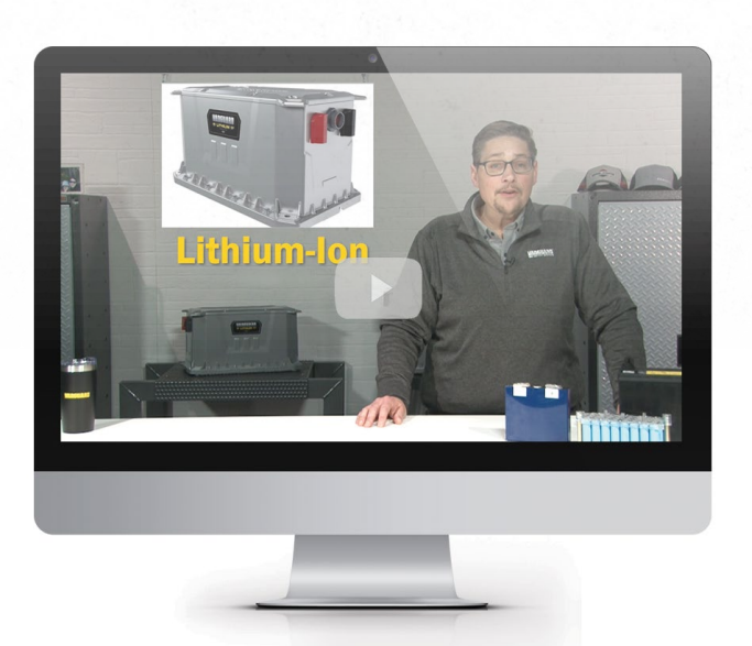
Explore Vanguard batteries, view our educational Battery 101 videos or start the conversation with our electrification experts at: vanguardpower.com.

*Total energy measured using a 0.2C discharge per IEC 61960-3:2017