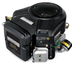
Vertical Shaft 16.0–23.0 Gross HP*

Each engine is engineered to dependably take on the most demanding commercial applications. As the lightest and most compact V-Twins among leading brands, the Vanguard™ “small blocks” feature a number of advanced technologies and integrated components to put more power in a smaller space.