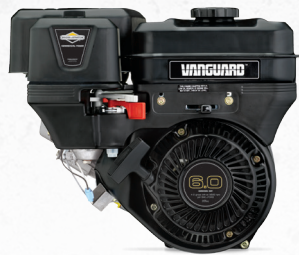
5.5–10.0 Gross HP*

*All power levels are stated gross HP at 3,600 RPM per SAE J1940