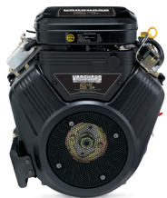
Horizontal Shaft 13.0–23.0 Gross HP*